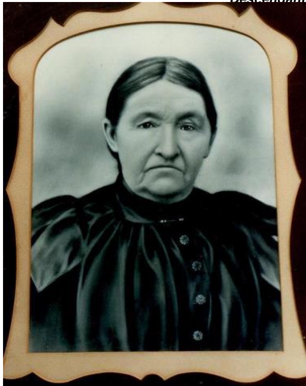
South Wales, Australia.