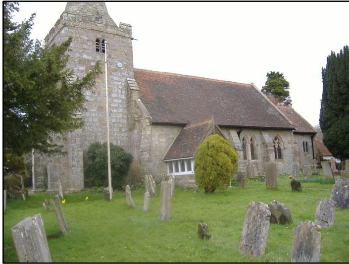
Dallington Church, Dallington, Sussex