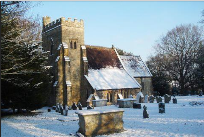
St Giles Church, Bodiam and graveyard

That, is why I do my family genealogy, and that is what calls those young and old to step up and put flesh on the bones.