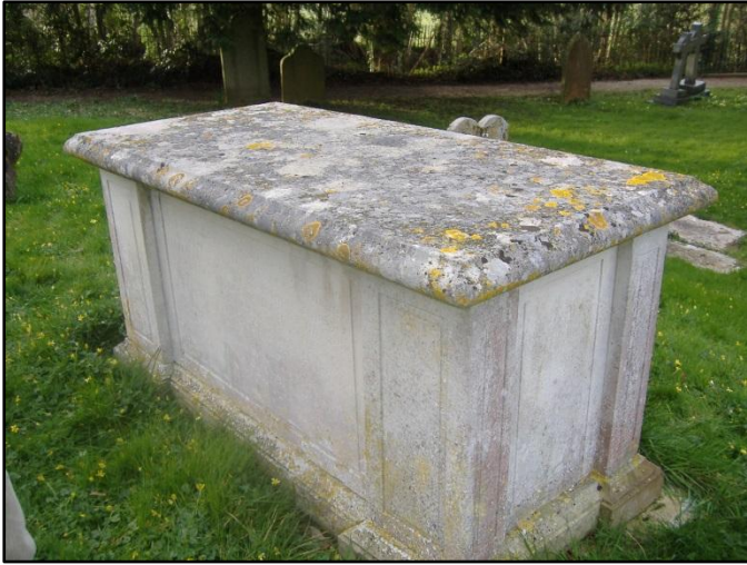
Grave of Persephone Sivyler at St Giles Church, Bodiam