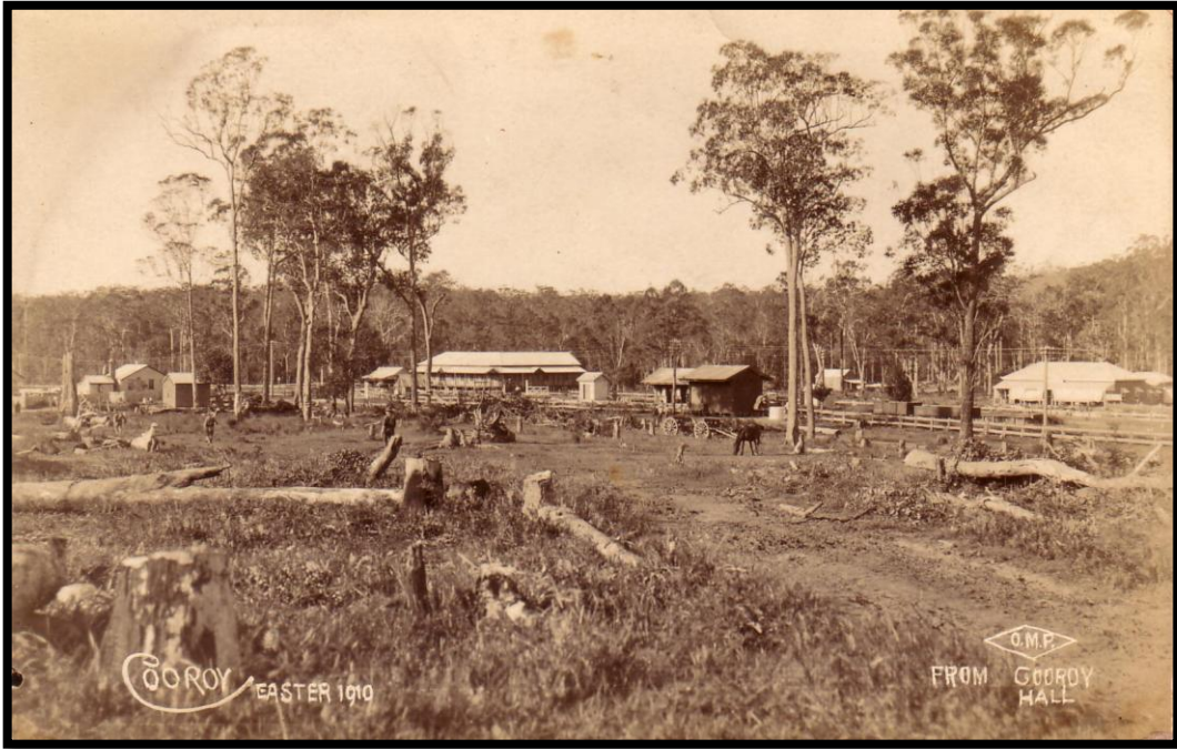
This photo of Cooroy was taken in 1910, it shows future generations of where Spencer's second family grew up and what it was like then